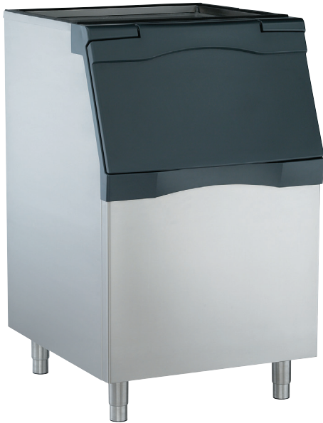
B530S shown with optional KLP8S legs